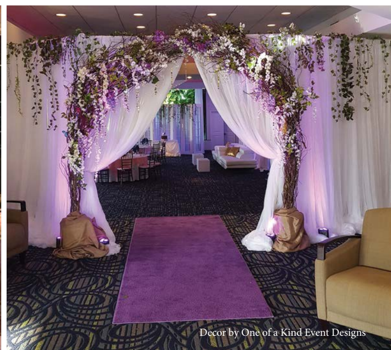
Decor by One of a Kind Event Designs