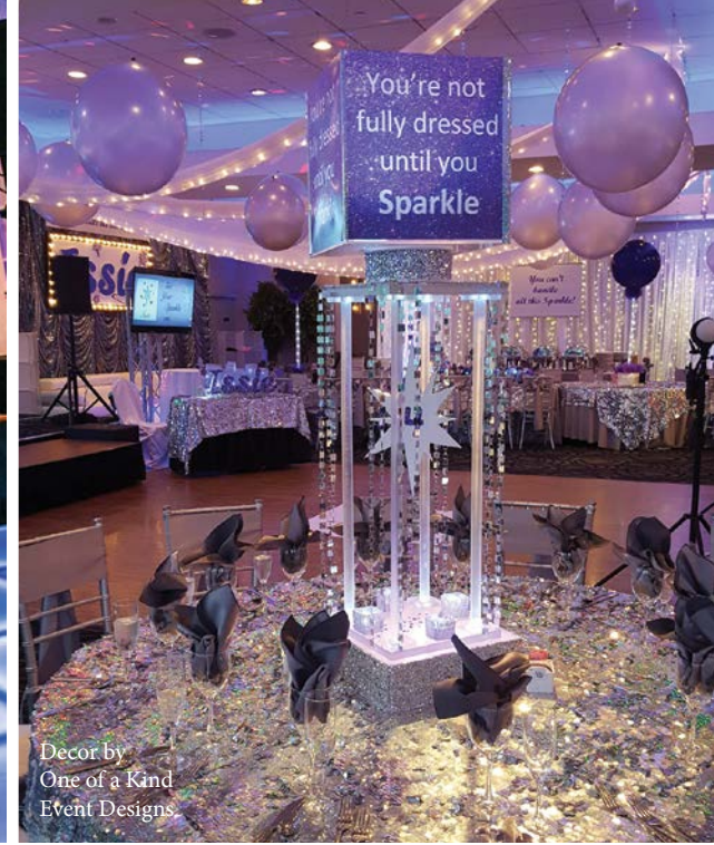
Decor by One of a Kind Event Designs