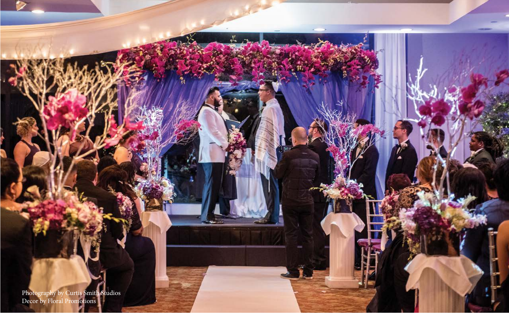
Decor by Floral Promotions

Upgraded Selection of Custom Made Occasion Cakes • Jacaranda's Custom Roasted Coffees and Teas • White Glove Service