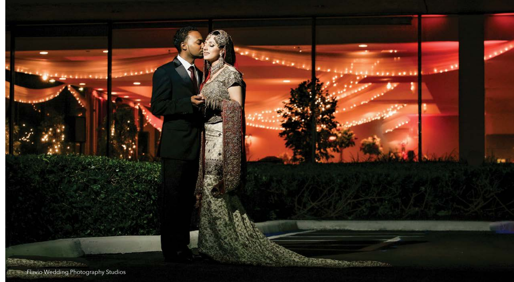
Flavio Wedding Photography Studios

Bring the Latin touch to your cocktail hour with a mélange of Chicken, Shrimp and Clams cooked and served in a Spiced Yellow Rice with Pigeon Peas. Presented with Cuban Sandwich Fingers Fried Plantains dusted with Brown Sugar