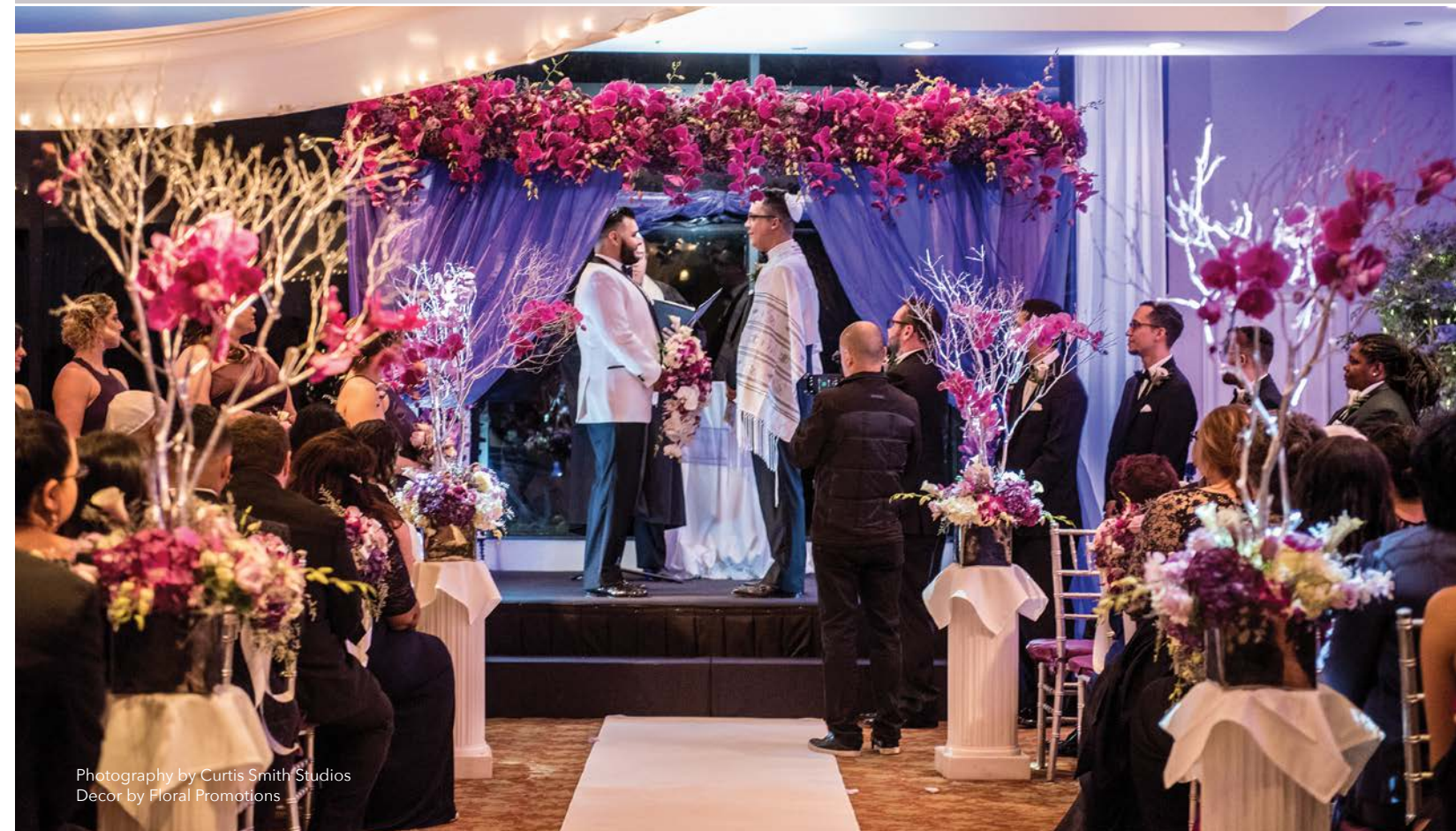
Decor by Floral Promotions