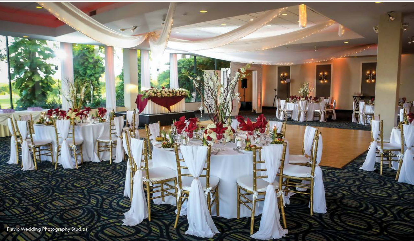
Flavio Wedding Photography Studios